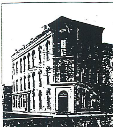
WARREN COUNTY STATE BANK